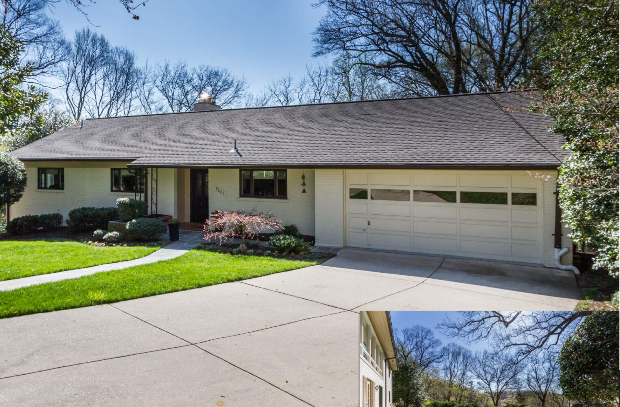
9601 Hillridge Drive Kensington, Maryland