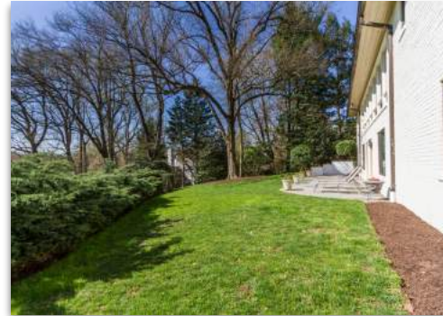
9601 Hillridge Drive, Kensington, Maryland 20895